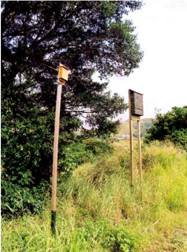
Fig 29. Bat-boxes of different designs, 2-chambered (on left) and 4-chambered (on right), installed in the HKWP.

為了解香港蝙蝠對棲所的需要，及提高本港市民對蝙蝠的保育意識，漁農自然護理署哺乳動物工作小組與濕地公園科於2005年8月始，合作進行了一項蝙蝠巢箱試驗計劃，成功於濕地公園內為東亞家蝠提供合適的棲所。