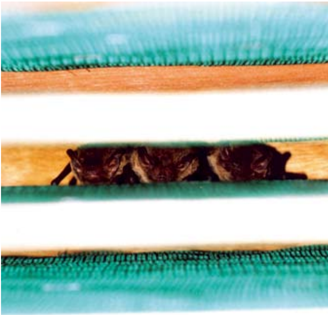
Fig 31. The Japanese Pipistrelle ( Pipistrellus abramus 東亞家蝠) roosting in a 4-chambered bat-box.

Bats were attracted before the first summer after box installation. This indicated the initial success of the project. Boxes were occupied by the Japanese Pipistrelle (Fig. 31) – a species commonly found foraging in wetlands like the HKWP and the Mai Po Inner Deep Bay Ramsar Site (Shek and Chan, 2006). The occupancies of the 2-chambered & 4-chambered bat-boxes were 62.5 % & 57.0 % respectively after one year of the installation.