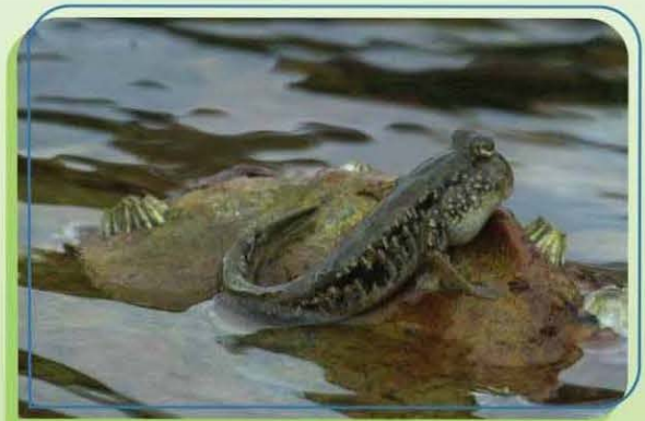
彈塗魚 Common Mudskipper ( Periophthalmus modestus )