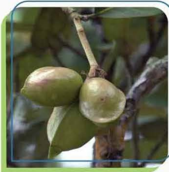
銀葉樹的種子可浮於水面 The fruits of Heritiera littoralis can float on water