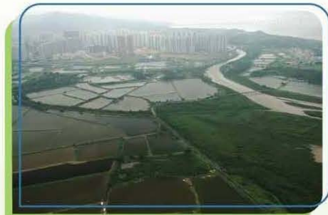
都市發展會對鄰近的紅樹林構成影響 Urban development causes influence to mangrove habitats