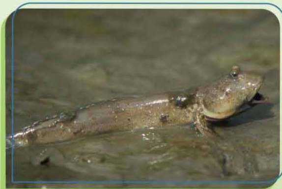
大彈塗魚 Bluespotted Mud Hopper ( Boleophthalmus pectinirostris )

香港有三種彈塗魚，分別是彈塗魚、大彈塗魚和青彈塗魚。其中，在香港濕地公園的紅樹林浮橋可以找到彈塗魚及大彈塗魚。相對大彈塗魚，彈塗魚的體形較細小，是肉食動物。而大彈塗魚主要攝食微細藻類及腐殖質為生。