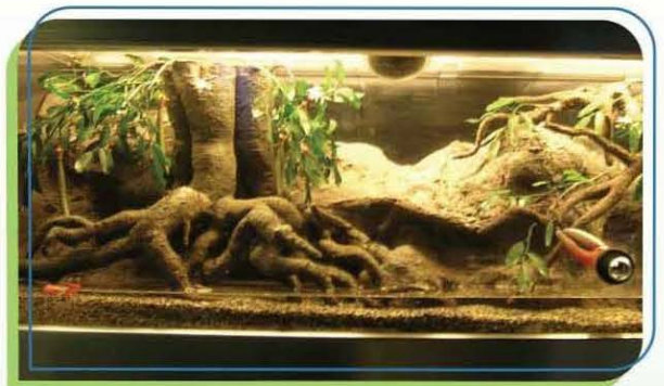
遊客可在香港濕地公園的香港濕地展覽廊仔細觀察招潮蟹的特徵 Visitors can take a closer look at fiddler crab at Hong Kong Wetlands Gallery in Visitor Centre of the Hong Kong Wetland Park