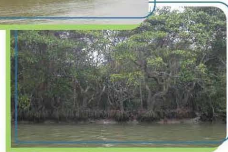
紅樹林是潮間帶獨有的生態環境 Mangrove is a unique ecosystem in intertidal zone