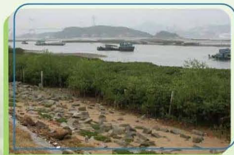
交通發展對紅樹林生境構成壓力 The demand of transportation exerts pressure to mangrove habitats