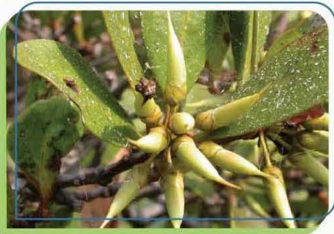
桐花樹葉上的佈滿鹽結晶 Salt crystals could be found on the leaves of Aegiceras corniculatum

Dropper of Kandelia obovata formed by viviparous reproduction which mangrove seedlings can grow and establish immediately once they reach a suitable substratum