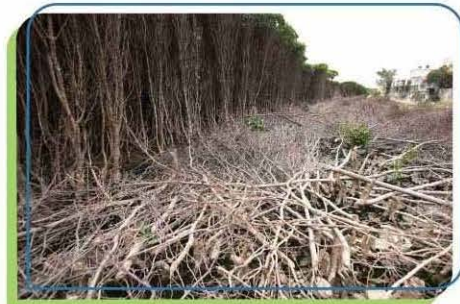
紅樹林被砍伐 Felled mangrove

Sustainability of wetland habitats depend on how wisely we use our natural resources. In Hong Kong, public consultation and Ecological Impact Assessment are required for any development in mangrove habitat. As responsible citizens, we can voice our concerns for conserving this valuable ecosystem, and minimise our disturbance during visits.