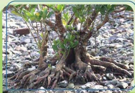
支柱根 Prop roots