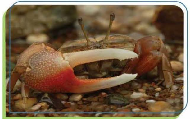
弧邊招潮蟹 Fiddler crab ( Uca arcuata )

There are 6 species of fiddler crab recorded in Hong Kong. Visitors may find the Uca arcuata feeding along the banks of watercourse near the Mangrove Boardwalk. In addition, they can also take a closer look at the fiddler crabs in Hong Kong Wetlands Gallery.