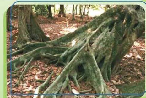
板根 Buttress roots